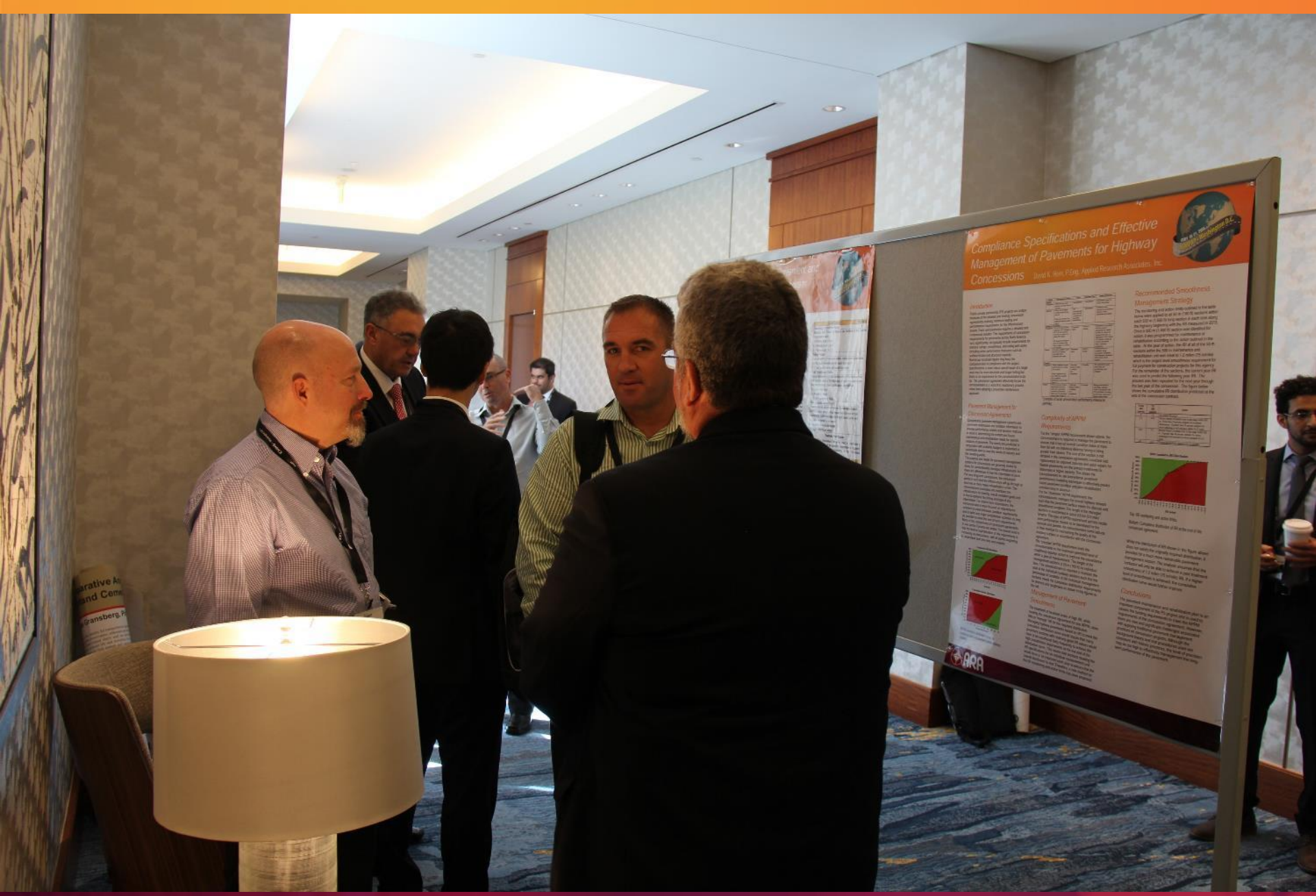
9th International Conference on Managing Pavement Assets | May 18-21, 2015