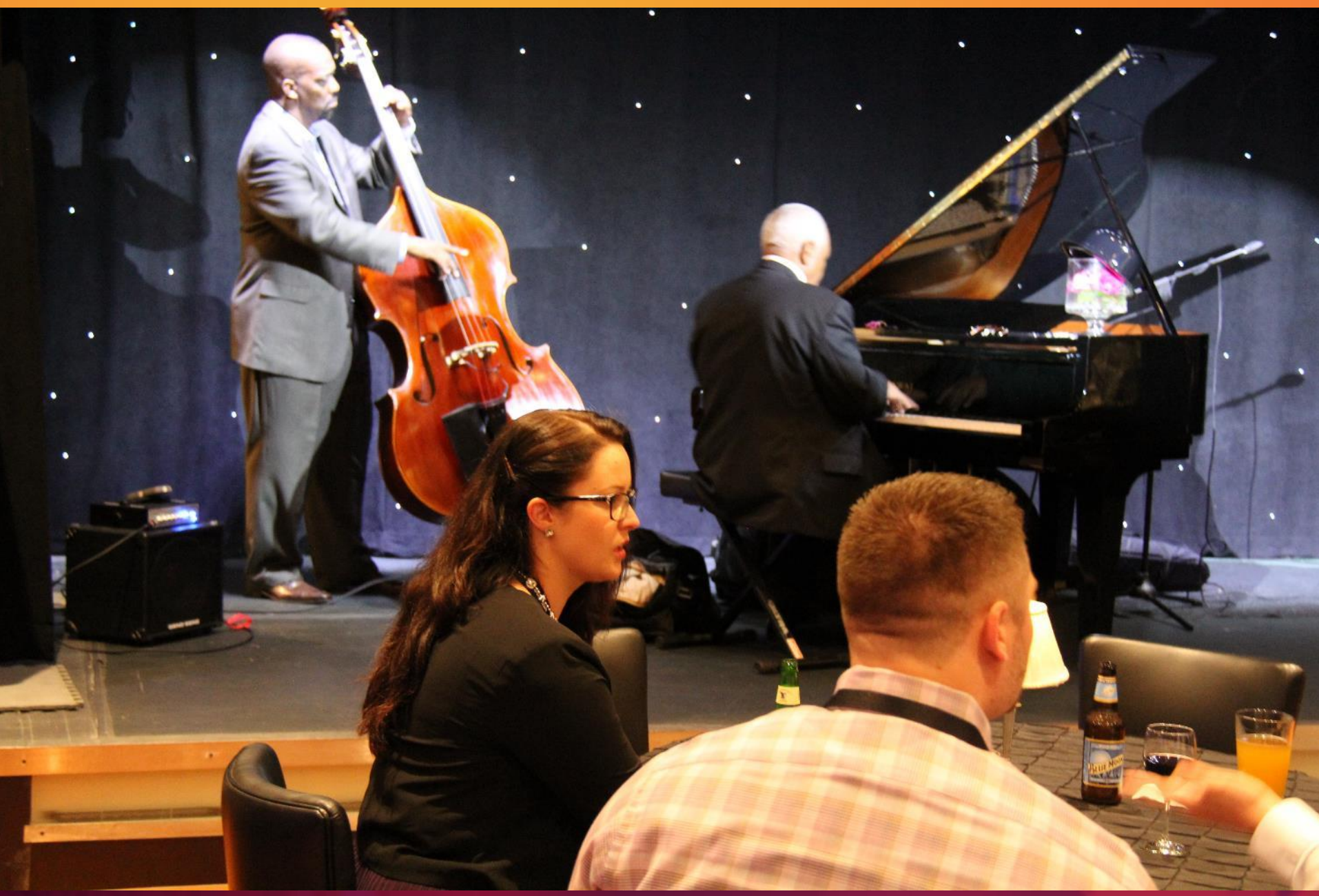
9th International Conference on Managing Pavement Assets | May 18-21, 2015