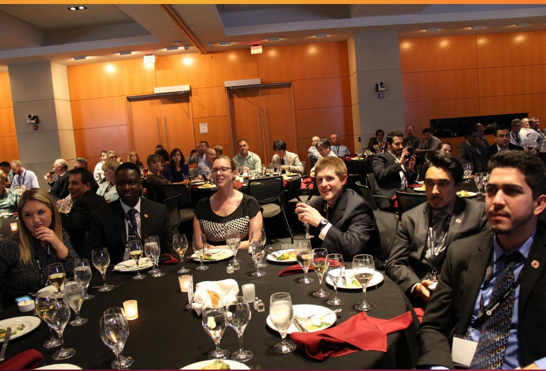
9th International Conference on Managing Pavement Assets | May 18-21, 2015