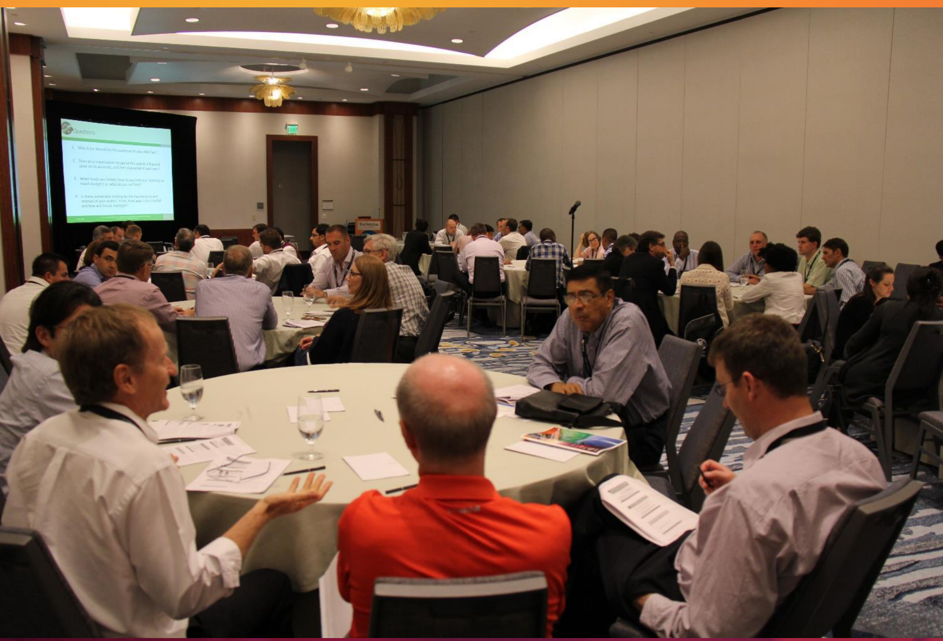
9th International Conference on Managing Pavement Assets | May 18-21, 2015