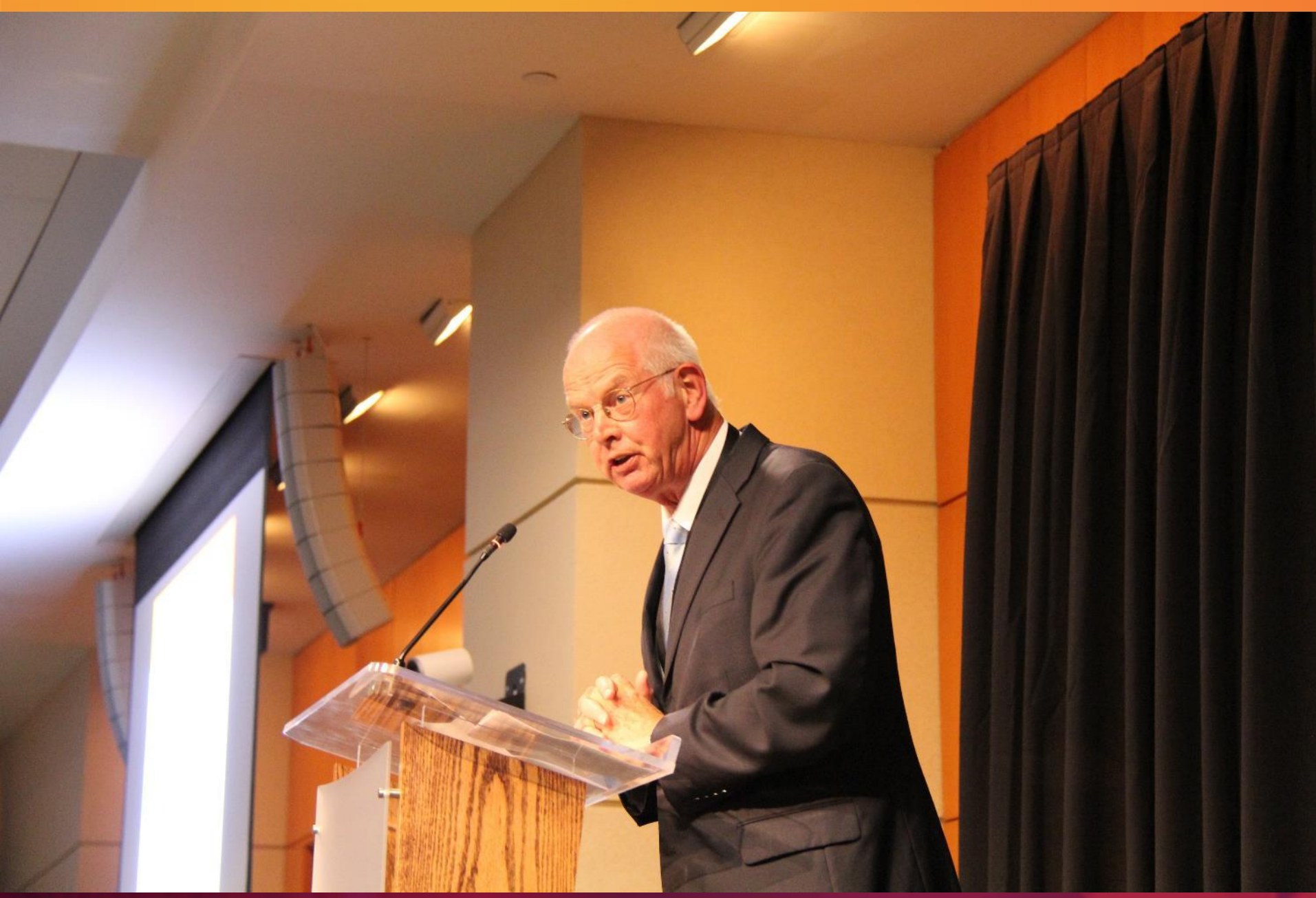
9th International Conference on Managing Pavement Assets | May 18-21, 2015