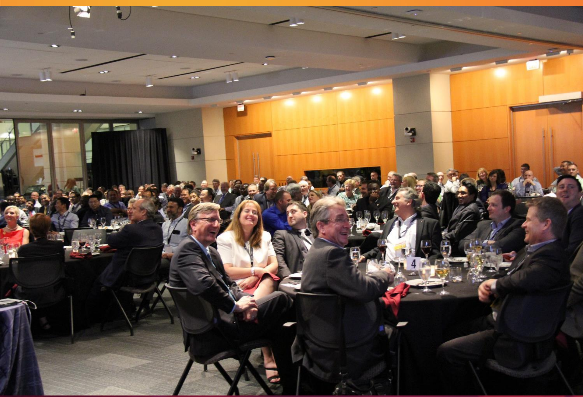
9th International Conference on Managing Pavement Assets | May 18-21, 2015