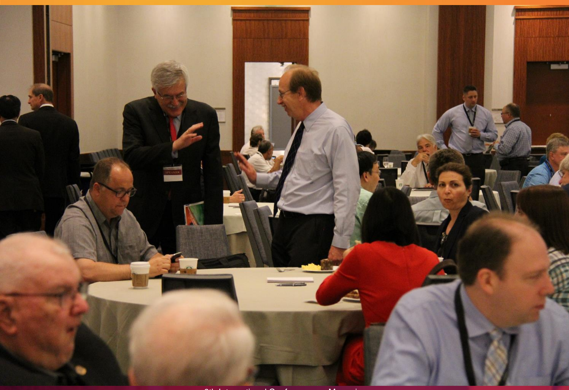
9th International Conference on Managing Pavement Assets | May 18-21, 2015